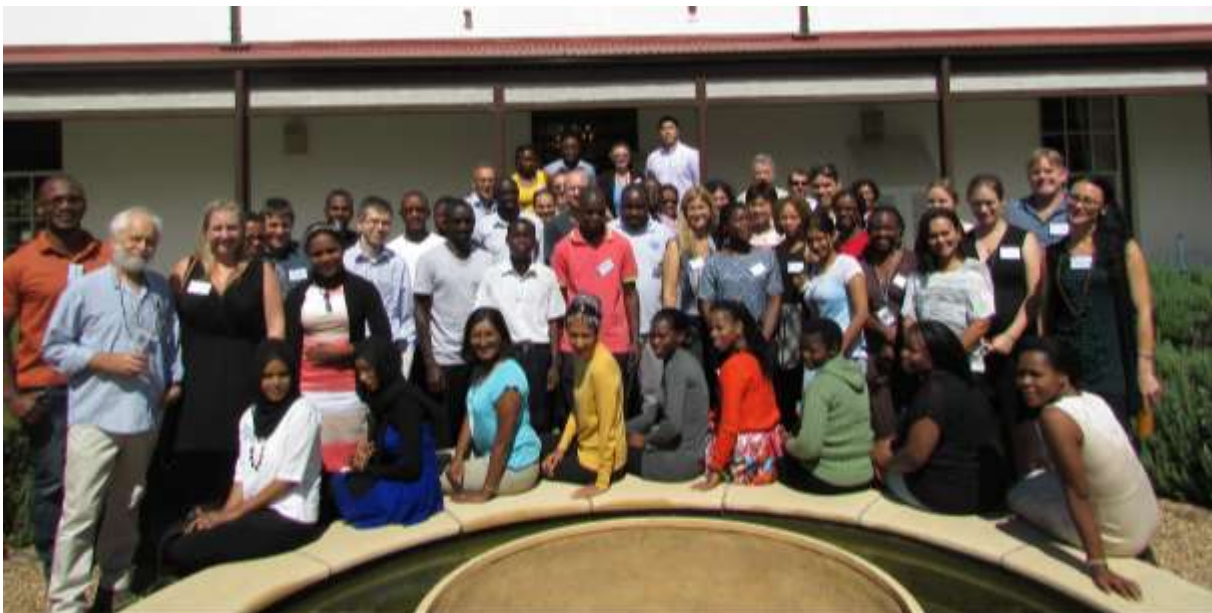
Staff, students and supervisors at SACEMA Annual Research Days Meeting, March 2015