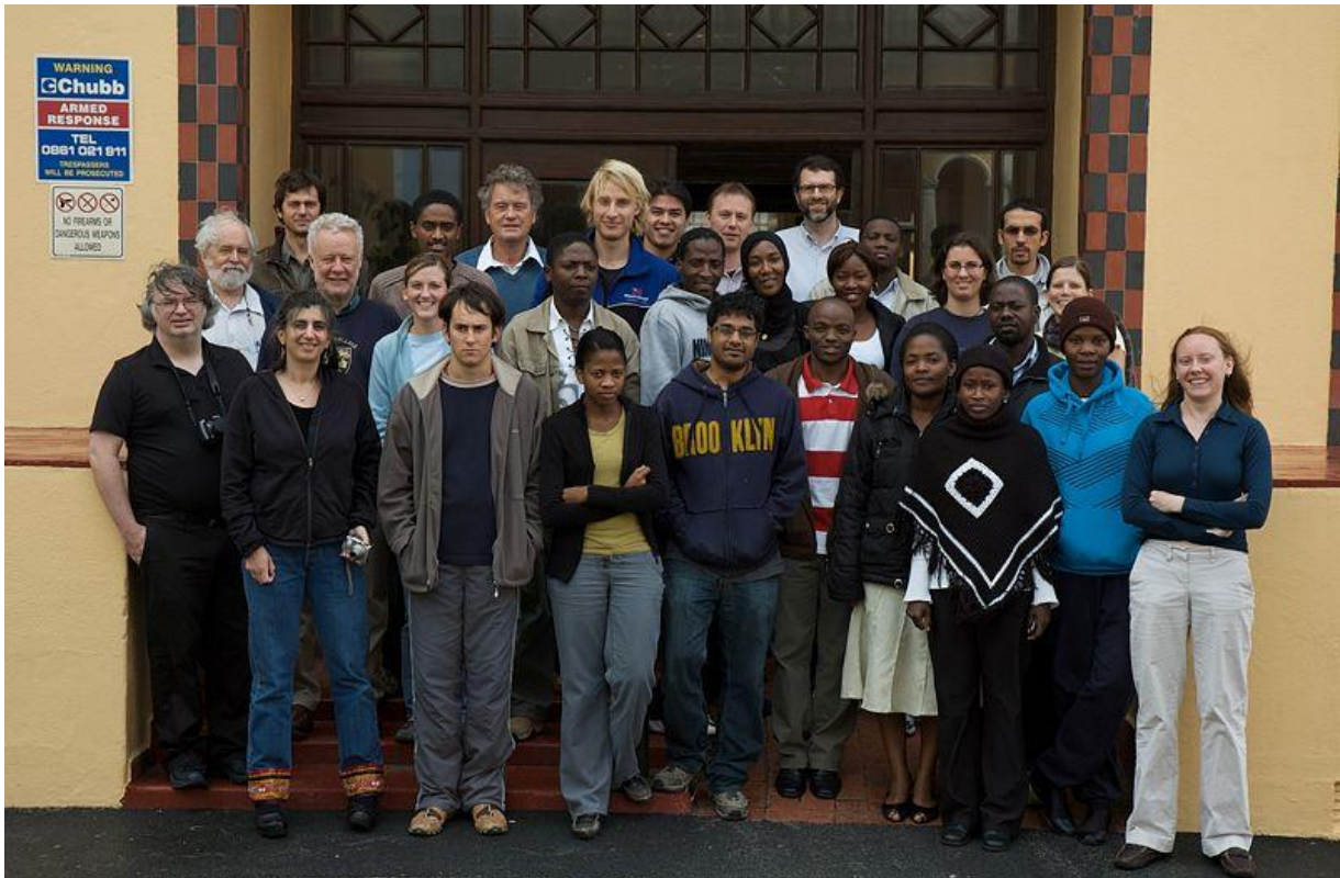
Data Modelling Clinic participants and faculty on the steps of the African Institute of Mathematical Sciences, Muizenberg

DIMACS again teamed up with SACEMA to bring together postgraduate students from the USA and various African countries to pursue projects on the modelling of epidemiological issues. This year's course entitled "The Meaningful Modelling of Biological Data" was held at AIMS in Muizenberg from 11 th to 16 th May 2009. The aim was to engage participants in epidemiological modelling methodologies using real biological data and grappling with practical questions in a meaningful way. This year there were 25 participants from the USA, Africa and South Africa.