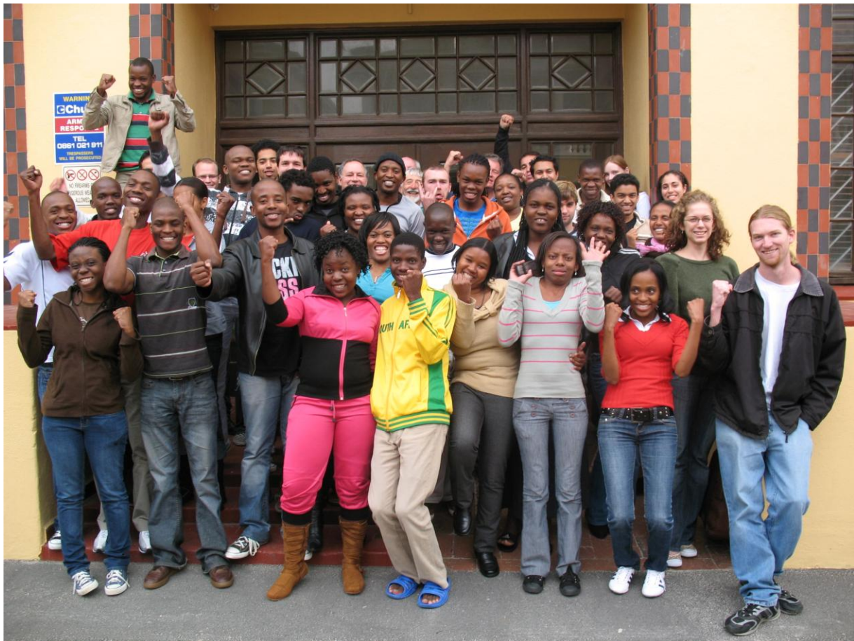
Participants and lecturers at the introductory course on the Applications of Mathematics in Biology and Medicine

This year, a total of forty-nine students attended the course, from eleven universities around the country (Fort Hare, Limpopo, Nelson Mandela Metropolitan, North West, Pretoria, UCT, UKZN, UWC, Venda, Wits, and Zululand). They were addressed on a range of modelling subjects to demonstrate how mathematical modelling is used to address medical and biological problems. Copies of the lecture presentations will be available soon on the SACEMA website: http://www.sacema.ac.za