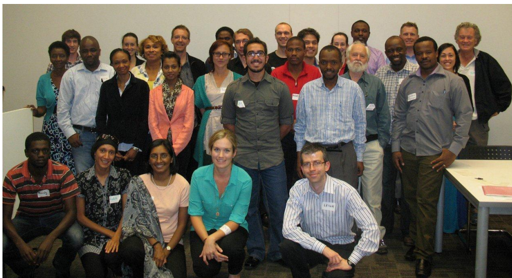
Students, supervisors and staff at SACEMA Research Days, Stellenbosch, March 2013

Participants were invited to a reception at SACEMA on Monday evening, when we welcomed newcomers and old friends alike. The conference dinner was held on the second evening in Decameron Restaurant, and the meeting concluded with a spit-braai on the final evening, at SACEMA.